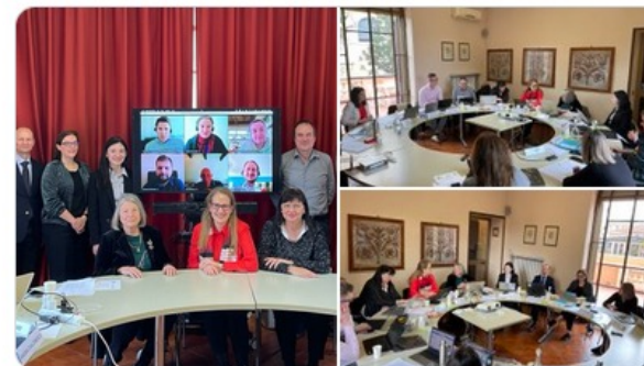
You and CIMEA

The 6th meeting of the #EHEA Task Force on Enhancing Knowledge Sharing in the EHEA community was taking place in Rome @CIMEA_Naric today. We had lots of productive discussion and have many activities to be taken forward! #BFUG #HigherEd