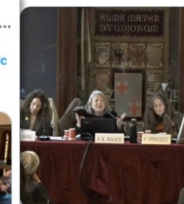
EHEA - BFUG